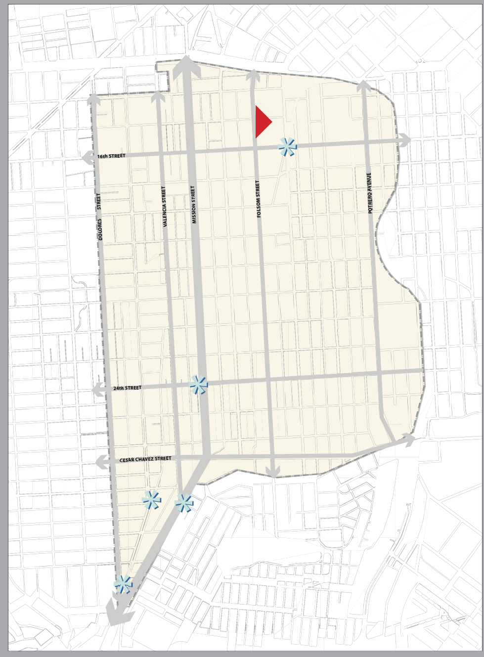
Proposed Concept for a new plaza and community gardens at the intersection of 16th, Harrison, and Treat Streets