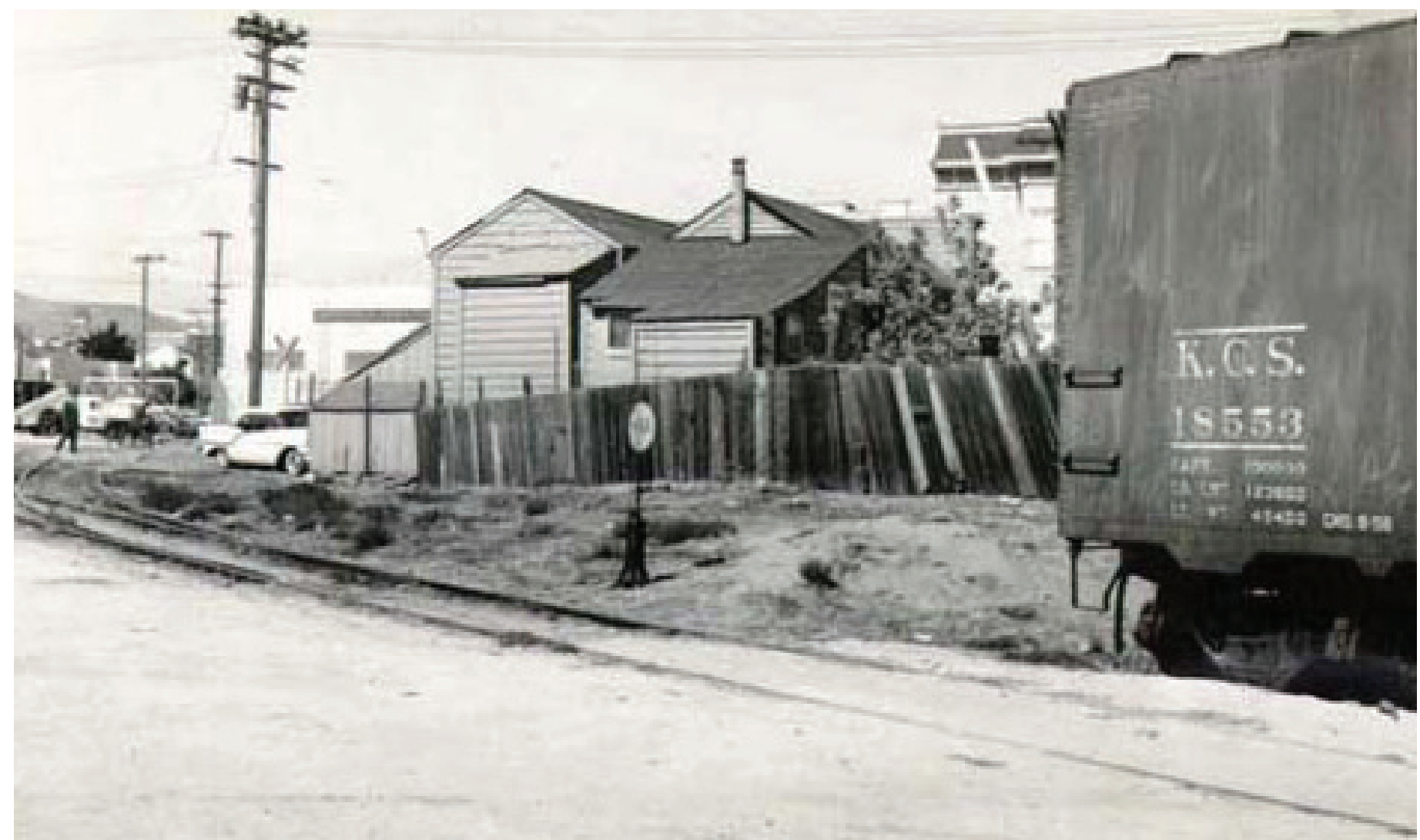
TREAT AVENUE IN 1959 WITH ACTIVE SOUTHERN PACIFIC RAILROAD TRACKS