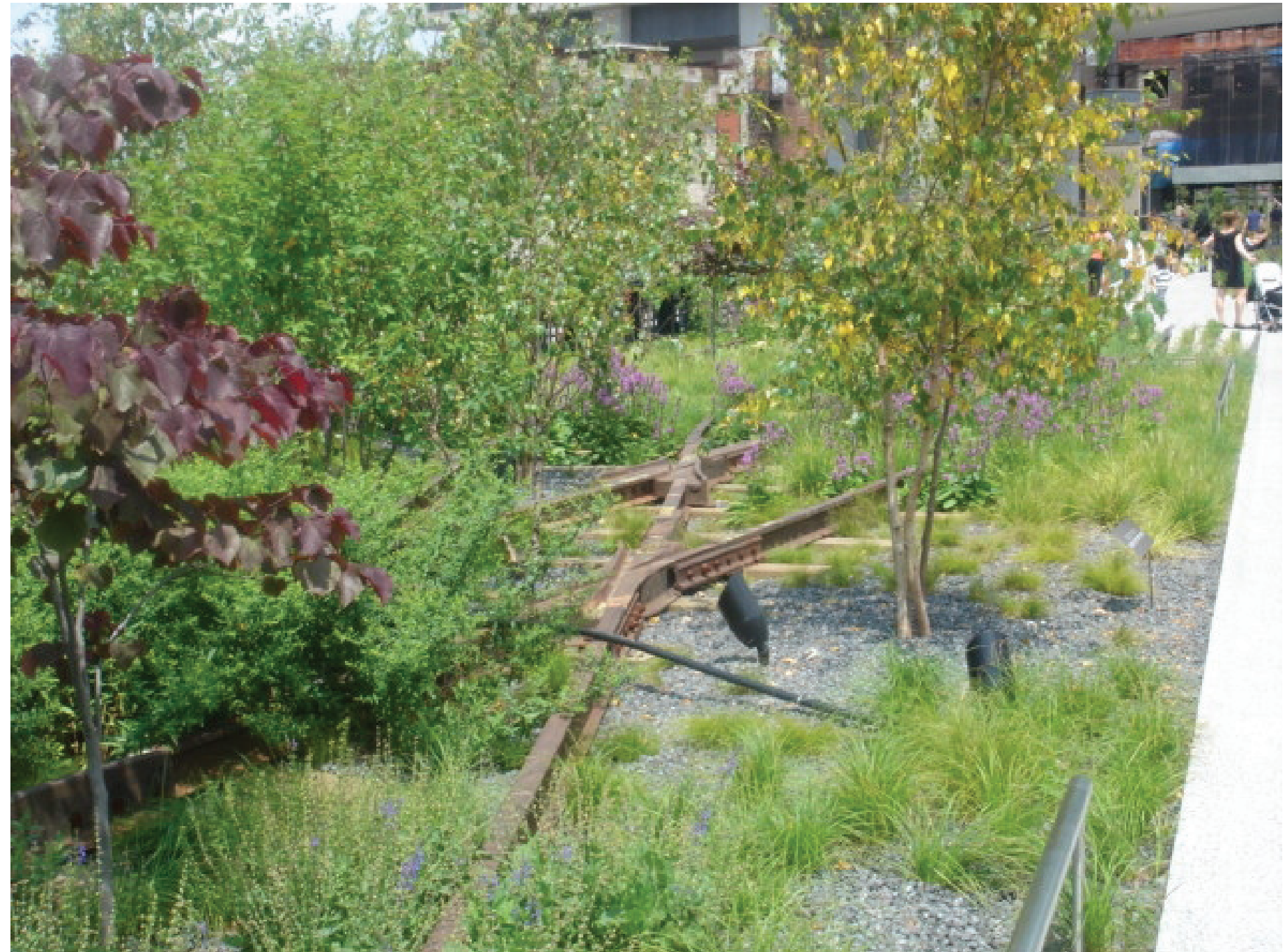
THE HIGH-LINE, NYC - FORMER RAILWAY CONVERTED TO PARK