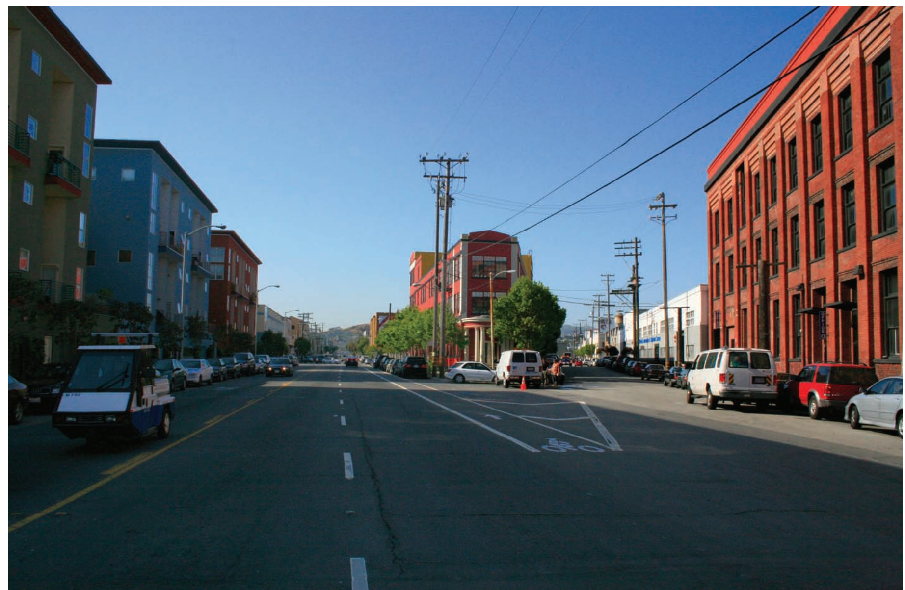
TREAT AND HARRISON STREET INTERSECTION TODAY